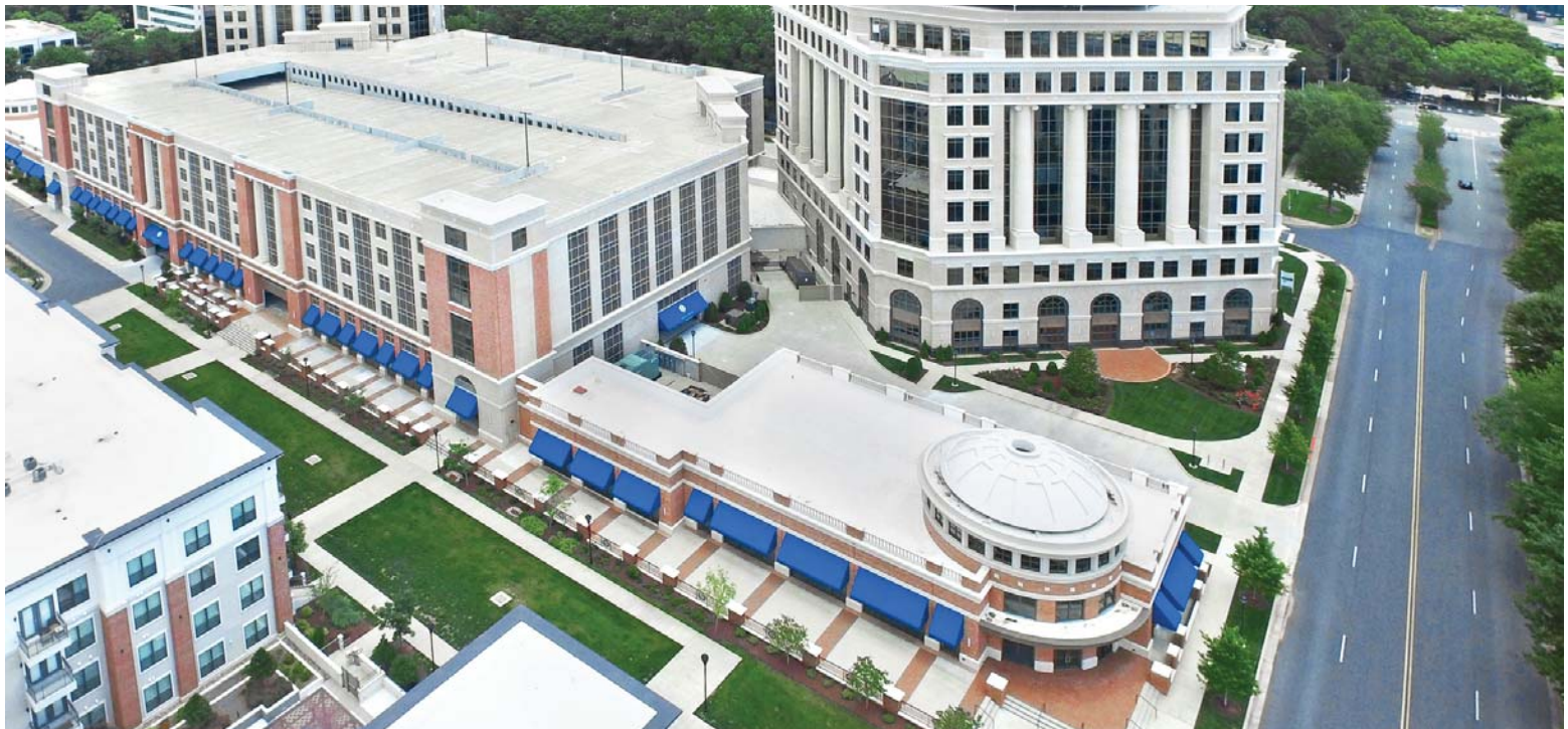
Parking Deck & Retail Space